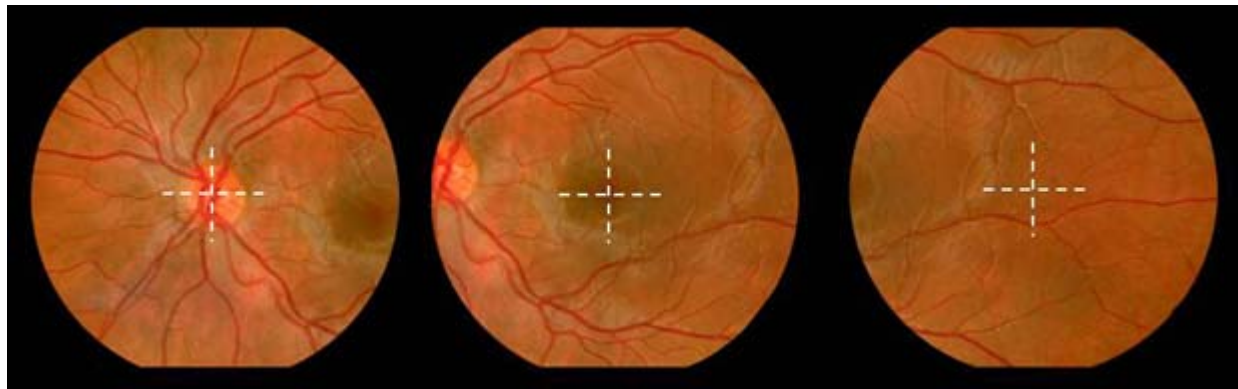
Left eye of the 1, 2 and 3 fields